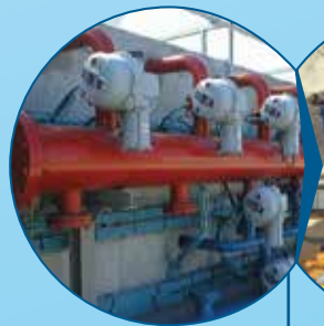
CCMP Oil Storage, Saint-Pierre-des-Corps, France