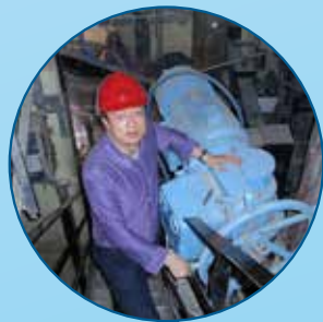
LINGAO II Nuclear Power Plant, Guangdong, China