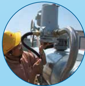
PETROCHINA Refinery Tank Farm, Yunnan, China